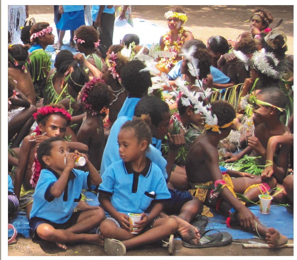
ANCOP's pre-school now caters for up to 150 children. With ages ranging from 3-18 years old, each child is experiencing school for the first time.